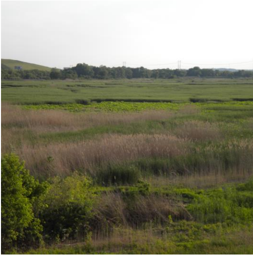
The Russel W. Peterson Marsh & Urban Wildlife Refuge