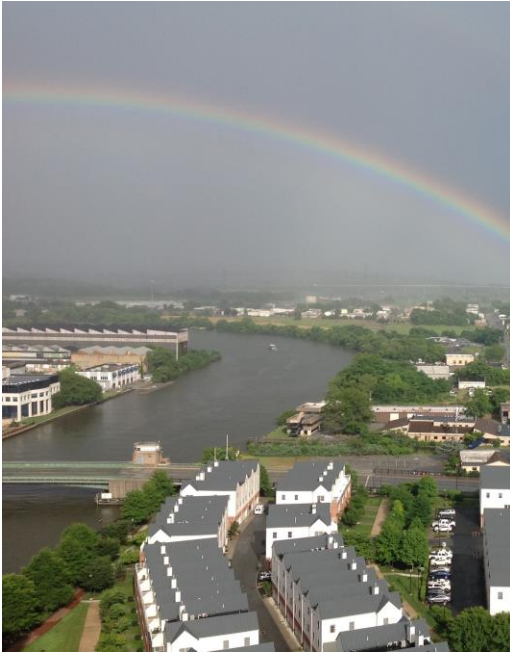
The Lower Christina River in Wilmington, Delaware